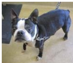
Stray Dog "Benson"