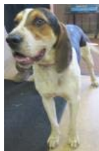
Stray Dog "Angus"